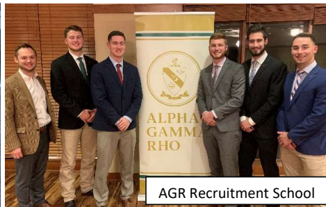
AGR Recruitment School