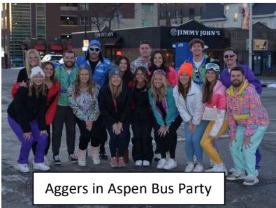
Aggers in Aspen Bus Party