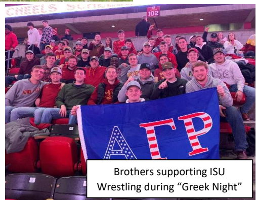
Brothers supporting ISU Wrestling during "Greek Night"