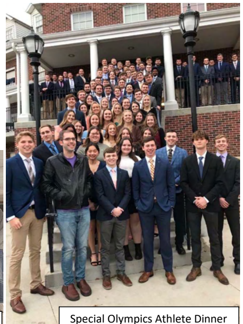
Special Olympics Athlete Dinner with our Greek Week Pairing