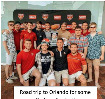
Road trip to Orlando for some Cyclone Football