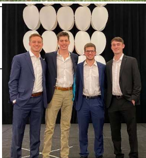
Brothers at AFLV Conference in Indianapolis